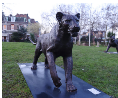
No. 1 Length:190cm, Width: 60 cm, Height: 90cm, Weight: 210 Kg Square metres: 1.14