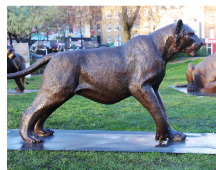
No. 3 Length: 200cm, Width: 82cm Height: 100cm, Weight: 268 Kg Square metres: 1.64