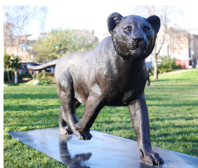
No. 2 Length: 190cm, Width: 74cm Height: 90cm, Weight: 238 kg Square metres: 1.41