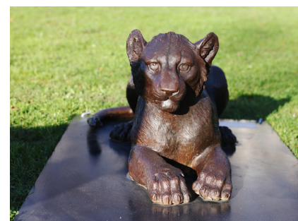
No. 16 Length:133cm, Width: 73 cm, Height: 43cm, Weight: 139 Kg Square metres: 0.97