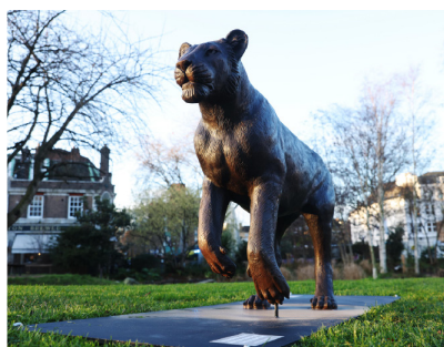
No. 8 Length: 185cm, Width: 65 cm Height: 90cm, Weight: 210Kg Square metres: 1.20