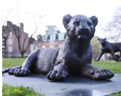
No. 15 Length: 127cm, Width: 79 cm Height: 43cm, Weight:143 Kg Square metres: 1.00