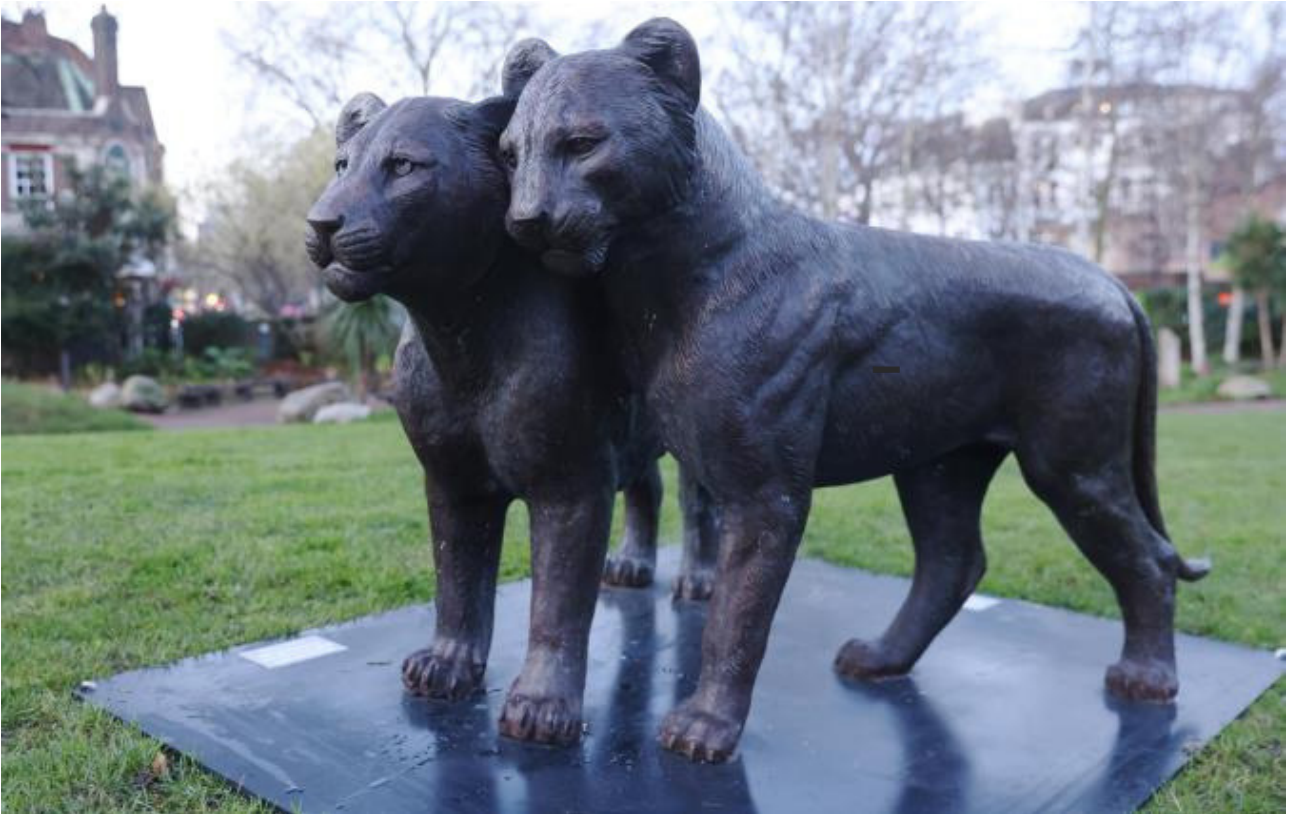
Double Cub Sculpture (No. 6) Length:155cm, Width: 130cm, Height: 97cm, Weight: 371 Kg, Square metres: 2.02