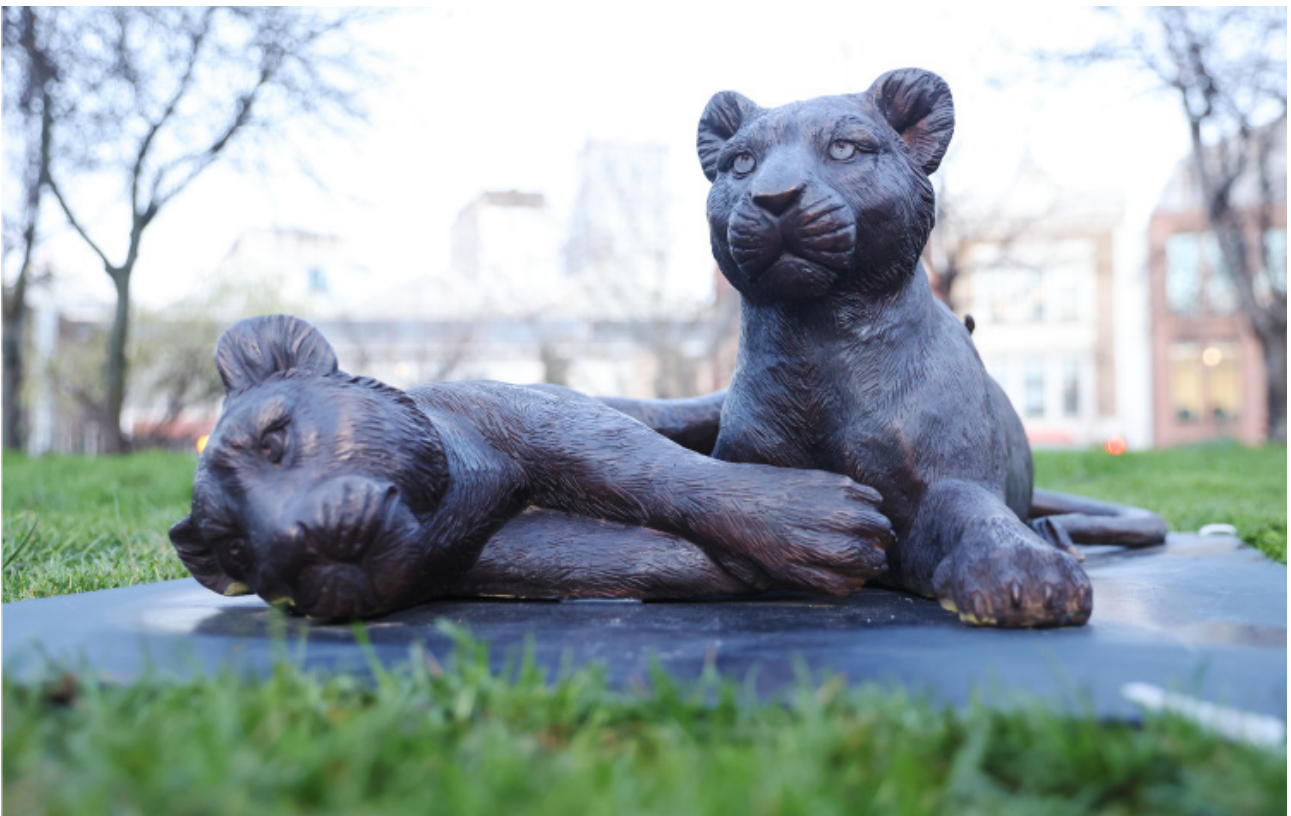
Double Cub Sculpture (No. 14) Length:142cm, Width: 100 cm, Height: 45cm, Weight: 211 Kg, Square metre: 1.42