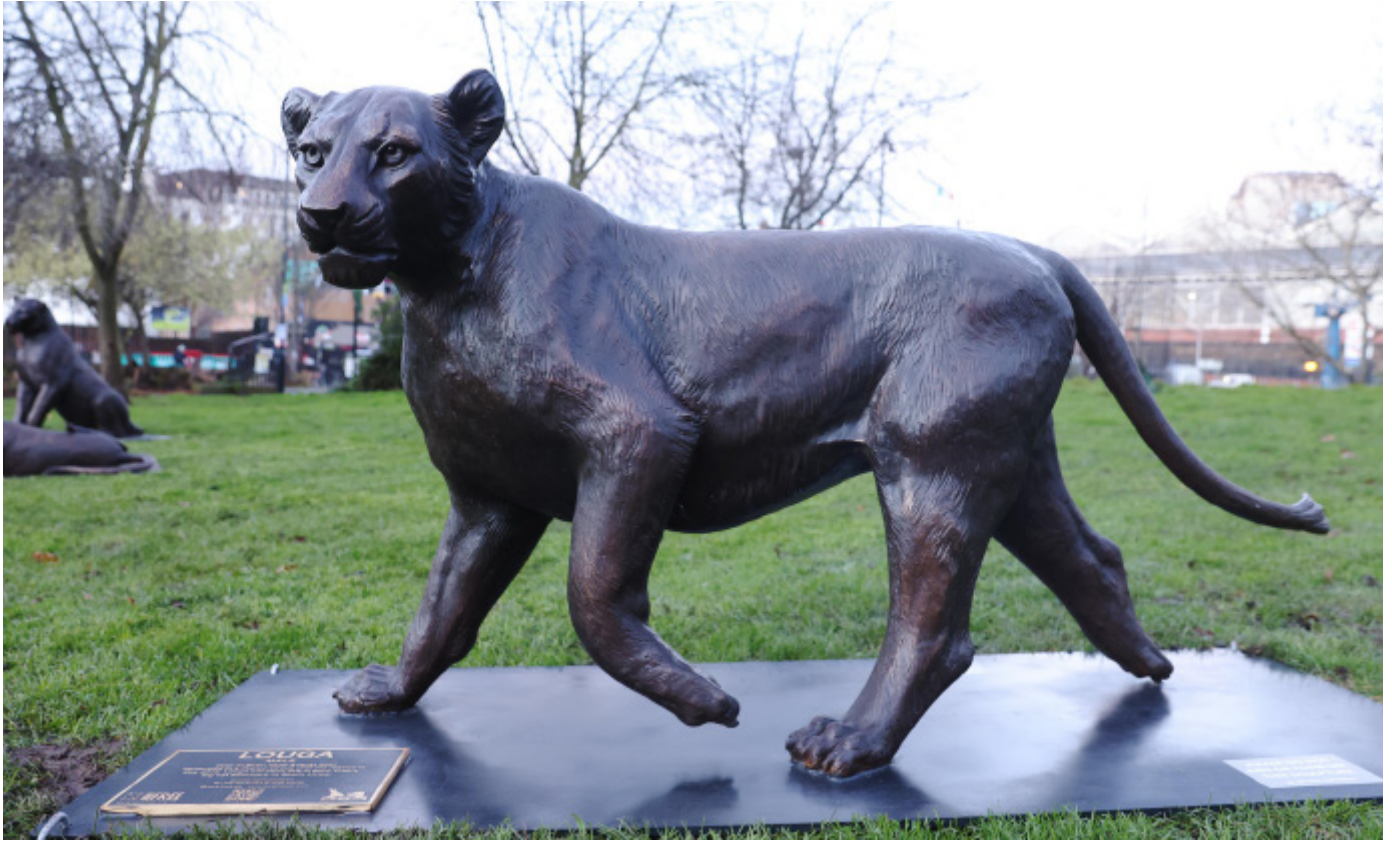
LOUGA (No. 17)

Length: 175cm, Width: 74 cm Height: 90cm, Weight: 230 Kg Square metres: 1.30