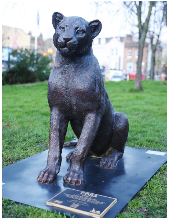
CORA (No. 13)

Cora has become relaxed in her new surroundings and is enjoying the sunshine and peace and quiet. She loves spending time with Alpha and they have a very close relationship.