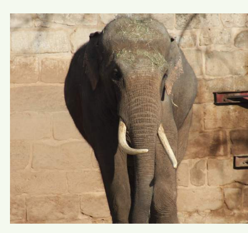
Zoo elephant 1 @ Born Free