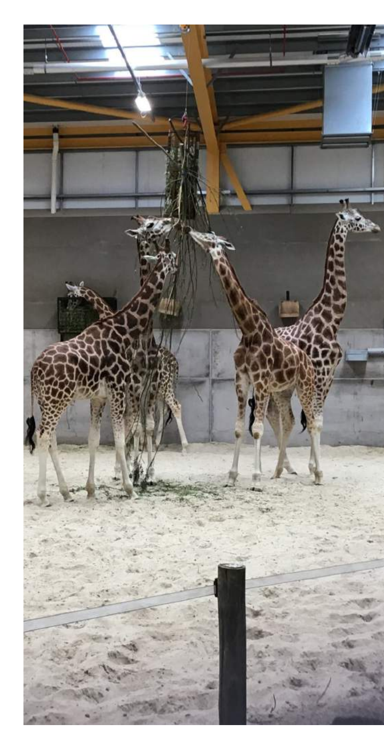
Giraffe 3

Each section is headed with a barometer marking to what extent improvements have been made. Disappointingly, our analysis of risk points towards either orange or red across a range of sectors. The authors of this report hope that the specific and practical suggestions made here can assist the Governments of the United Kingdom, Scotland, Wales and Northern Ireland in introducing necessary measures to make good on opportunities arising from leaving the EU to improve animal welfare and regain the UK's previous global leadership on animal welfare.