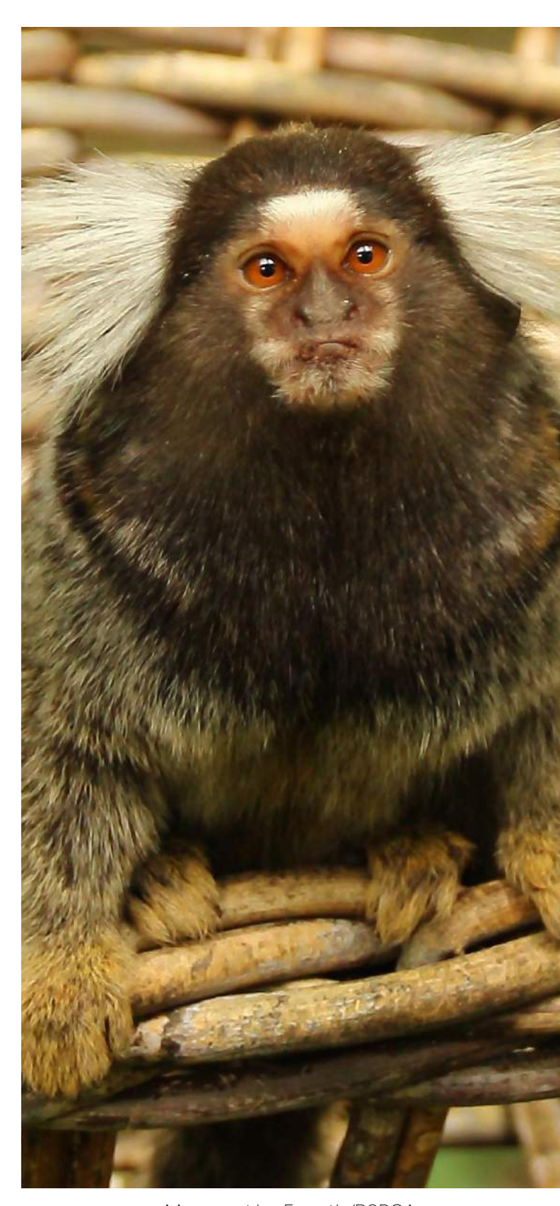
Marmoset

The UK has agreed it will introduce its SPS animal health import controls on imported products from the end of the year countrols on imported products from the end of the year countrols. It also has to decide if it wishes to adopt equivalent measures to the EU on animal health controls to reduce the paperwork and controls that will have to be put in place. There are concerns that the additional paperwork will impact on access to veterinary medicines. One proposal would be adopt a Common Veterinary Area with the EU, similar to the one the EU has with Switzerland.