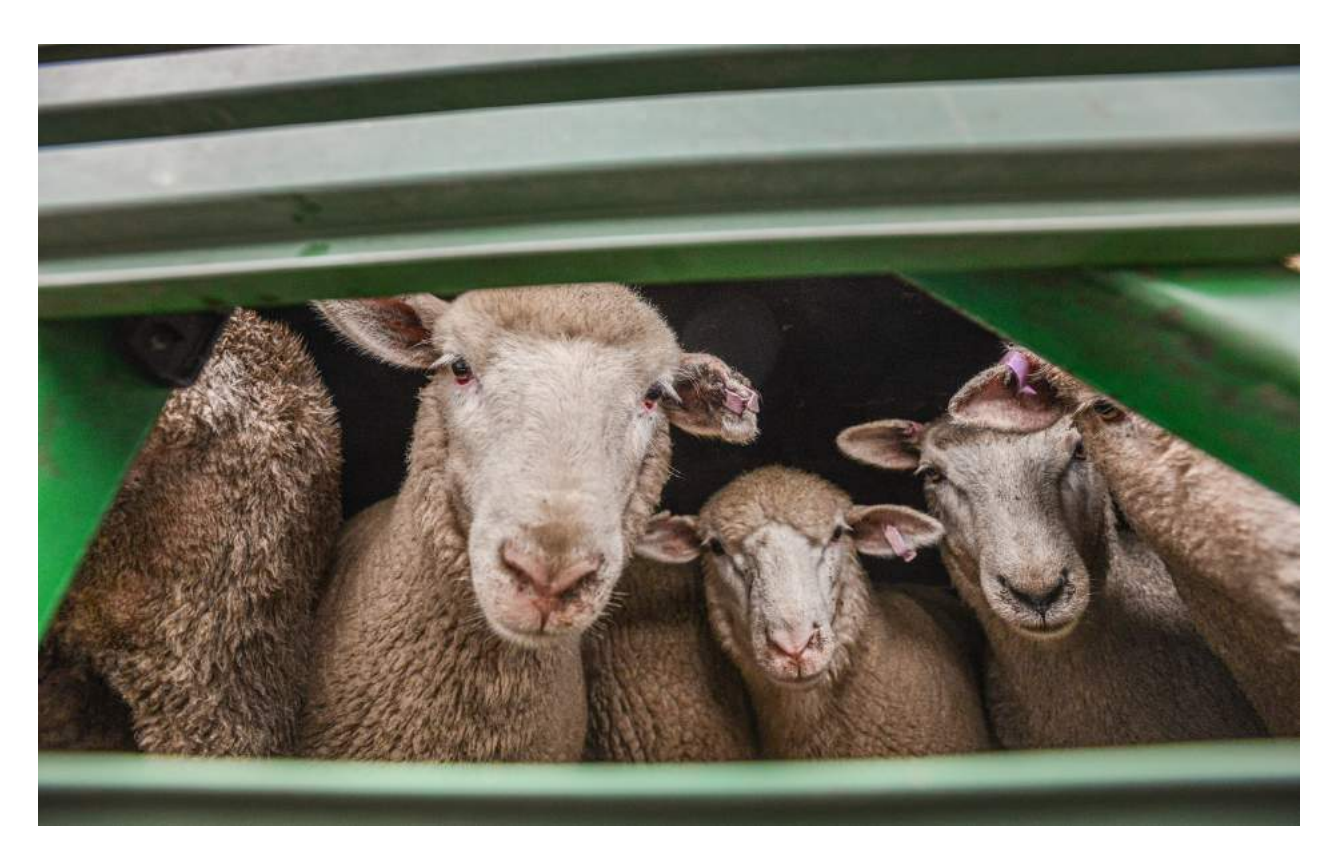
WAM9936 Sheep arriving at the sale yards