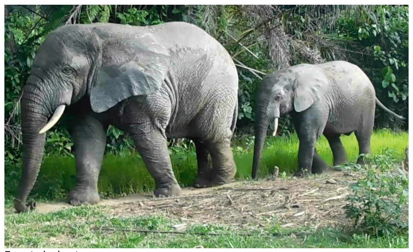
Forest elephants.