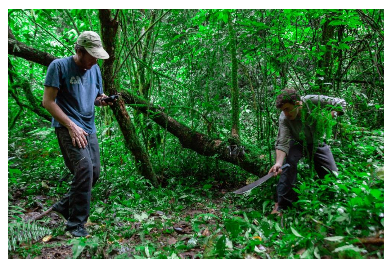
Installing a camera trap near Isla de Cañas.

The team is in the final stages of developing a deterrent collar for cattle, to be attached to some animals in each herd and emitting sounds of people talking, and lights during the night, to deter jaguars. It is hoped that reduced livestock losses will positively influence local community attitudes, leading to fewer retaliatory jaguar killings by disgruntled ranchers.