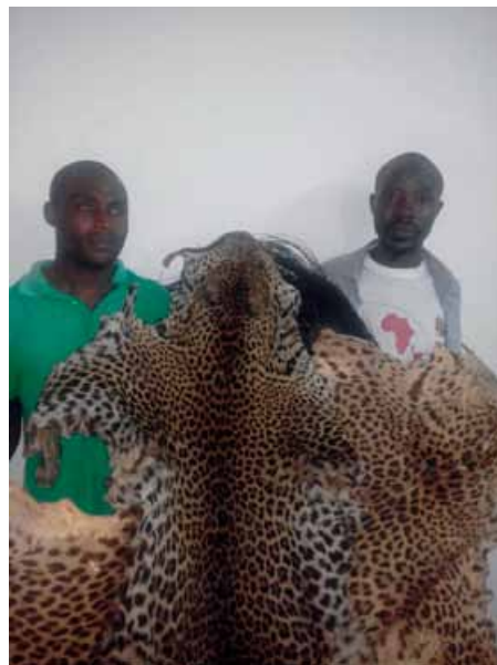
6 traffickers arrested and a ring of leopard skin traffickers crushed