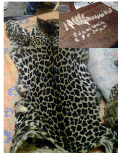
3 leopard skin traffickers arrested with two leopard skins and leopard teeth