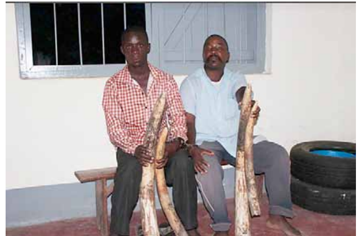
2 traffickers arrested in the west of the country near the Congo border with 25kg of ivory.