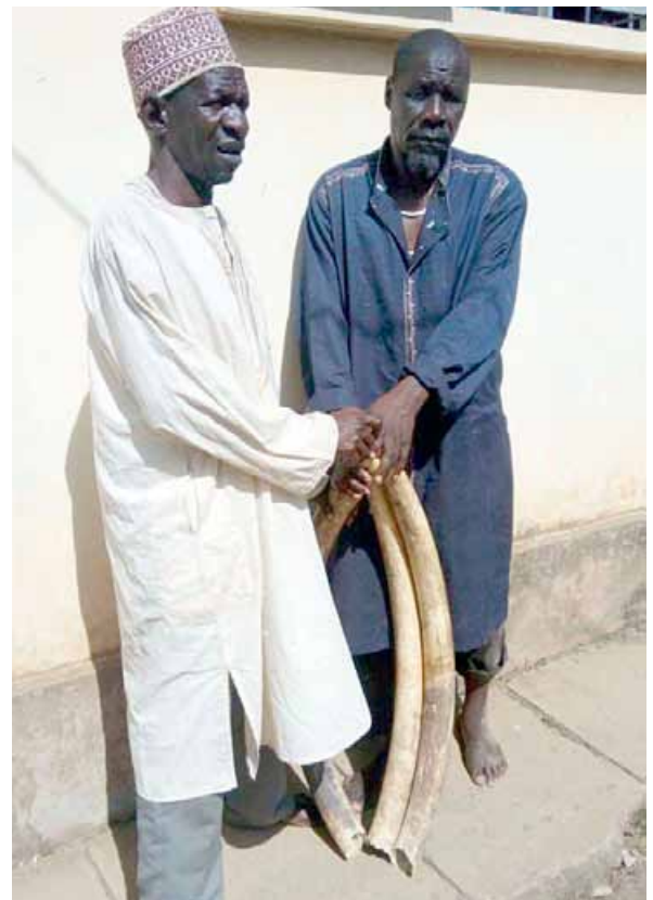
2 ivory traffickers arrested in the North of the country with 35 kg of ivory.