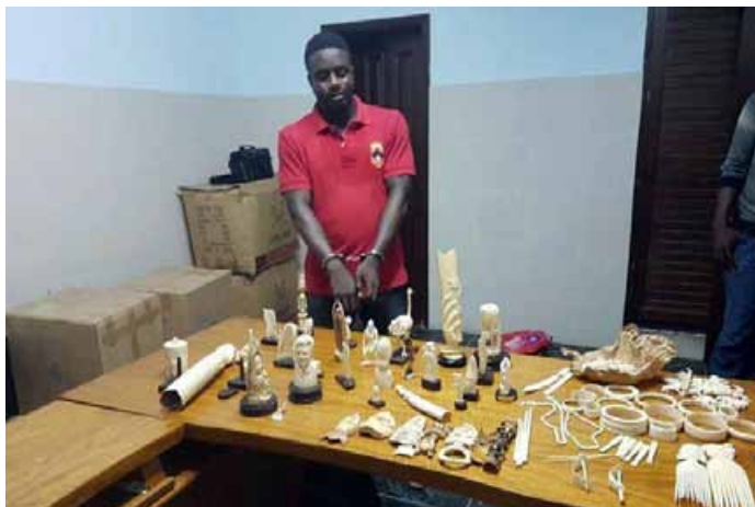
The 10 th replication of the EAGLE Network kicked off in a crackdown on ivory and leopard skin traffickers in Ivory Coast.

The 10 th replication of the EAGLE Network kicked off in a crackdown on ivory and leopard skin traffickers in Ivory Coast. In 3 operations 3 traffickers were arrested with 400 pieces of carved ivory, 40 kg of raw ivory, 7 leopard skins and other contraband. In two back to back operations 2 major traffickers were arrested, one with 6 tusks, weighting 40 kg and 7 leopard skins, the other one with 165 carved ivory pieces on the same day a few hours later. The third trafficker tried to escape the arrest but was captured two days later in the house of his parents with 235 carved pieces of ivory, a crocodile skin and several python skins. All three of them have been involved in an international network, trafficking ivory across the borders of the sub-region, mainly between Ivory Coast, Burkina Faso, Mali and Guinea. The operations were carried in Abidjan with the Ministry in charge of Wildlife and the UTC - the special unit against transnational organized crime. The WARA director led the operation, the Coordinator of GALF and a legal adviser joined her to support the operation.