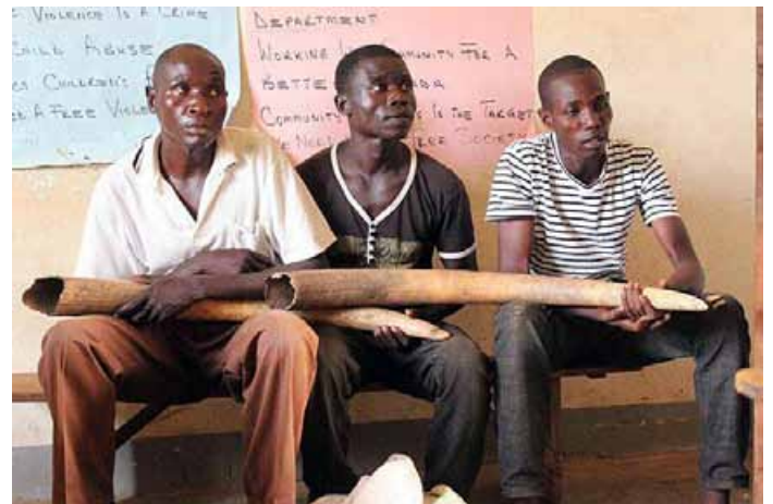
3 ivory traffickers were arrested with 2 tusks weighting 18.4 kg in Uganda

8 ivory traffickers were arrested in Uganda in 3 different operations. 2 ivory traffickers arrested in the North of the country with 35 kg of ivory. A muezzin and a watchman of a mosque were arrested in the act during an attempt to sell 3 tusks in the office of the mosque. The arrest highlights that religious positions can be used as a cover for wildlife crimes. 3 ivory traffickers were arrested with 2 tusks weighting 18.4 kg on the same