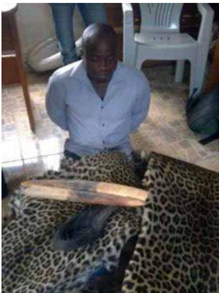
2 traffickers arrested with 2 leopard skins, 2 tusks and an elephant tail