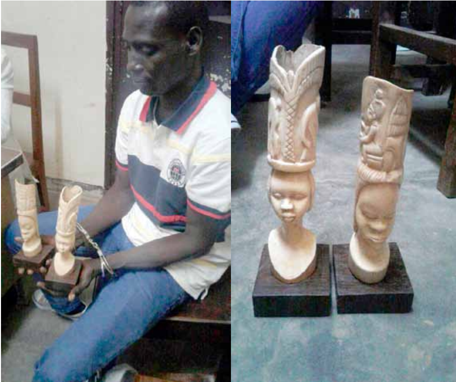
An ivory trafficker arrested with two pieces of carved ivory.

■ The Deputy Director and the Head of the Legal Department held a meeting with the Secretary General of the Ministry of Forests and Wildlife to discuss the renewal of the memorandum between LAGA and the Ministry, legal representation in cases and collaboration in general. They also met with the Director of Wildlife to discuss on evolution of wildlife operations in the field. They carried out a visit to one of the Inspectors General at the Ministry.