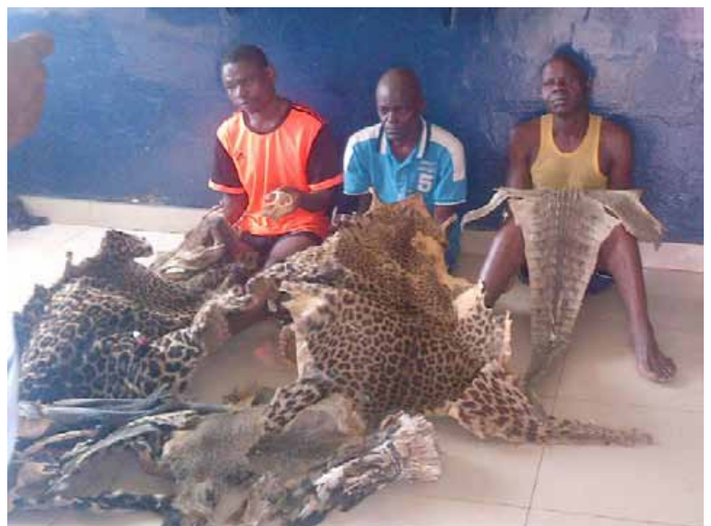
3 traffickers arrested with 2 leopard skins, 2 elephant tails and a skull and hand of a baby gorilla

■ The legal team continued to fight hard to get the prosecution back on track of the corrupt police officer, arrested for releasing repeat offender trafficker in April. This situation points to a widespread corruption in the