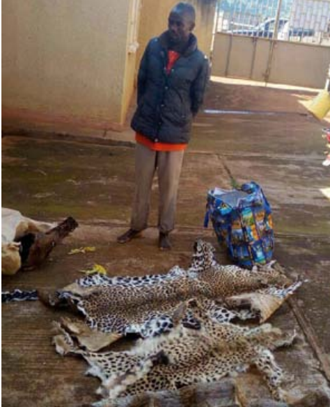
2 traffickers arrested with a cheetah skin and a leopard skin