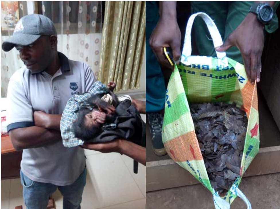
A baby chimp rescued and a wildlife trafficker arrested in the south of the country. He was also trafficking 35 kg of pangolin scales.

to the Mefou National Park, where caregivers of the Ape Action Africa quickly provided the appropriate treatment and care.