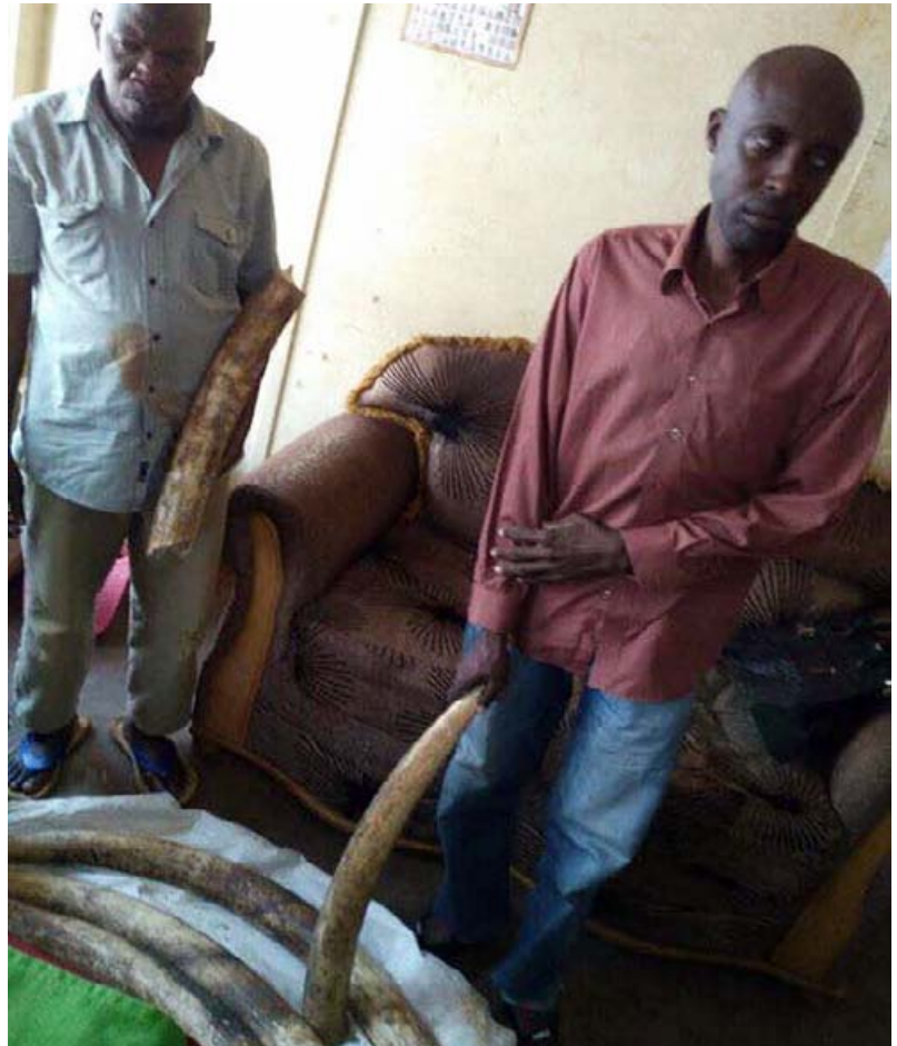
2 ivory traffickers arrested in Kampala with 4 tusks.