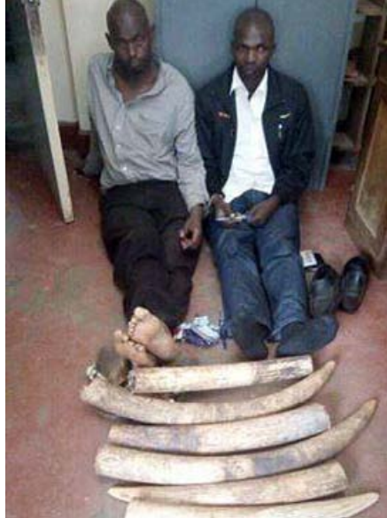
2 ivory traffickers arrested in Kampala with 4 tusks.