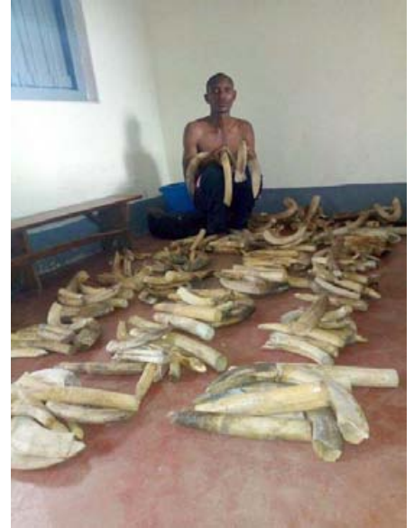
A trafficker arrested in western Uganda with 215 hippo teeth

■ 2 traffickers arrested with a cheetah skin and a leopard skin near the Kenya border. They have been trafficking wildlife contraband for several years. The first one was arrested in the act when he tried to sell the cheetah, leopard and 3 python skins. His fellow trafficker was arrested later in his house with 3 more python skins. There are less than 6,800 cheetahs left in the world making it the most endangered feline in the continent. There are less than 30 cheetahs left in Uganda, making this a very meaningful arrest operation.