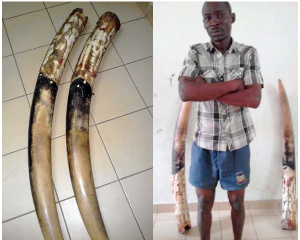
An ivory trafficker, a repeat offender, arrested with 2 large fresh elephant tusks

■ An ivory trafficker, a repeat offender, arrested with 2 large fresh elephant tusks in Franceville as he attempted to sell the contraband in a courtyard of a hotel. He was previously arrested for ivory trafficking in 2014, while carrying 4 tusks on a train to the capital city, and he spent 6