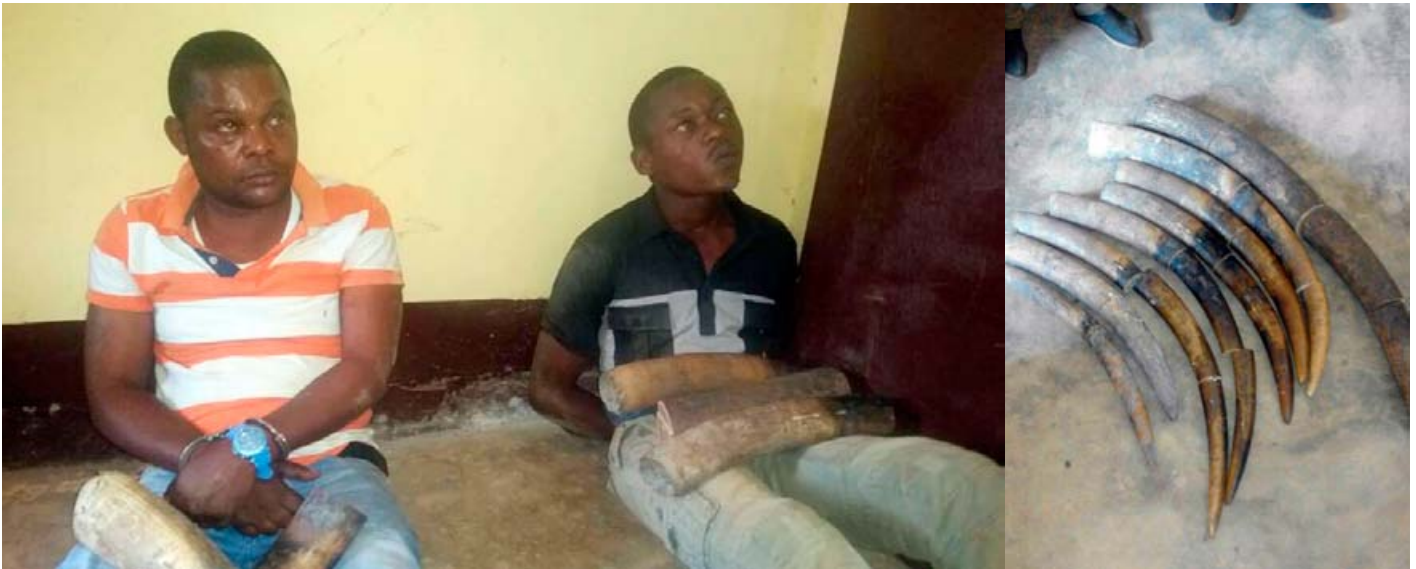
2 ivory traffickers arrested with 8 tusks, cut to 21 pieces

ficking ivory across the border from Gabon. One of them, an owner of a hotel, is in the centre of several trafficking rings, well connected to a network of traffickers. The other one has been transporting the ivory to the place of transaction. They were already arrested for ivory trafficking, but were released illegally by the Pointe-Noire court. Now they remain behind bars, awaiting trial.