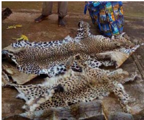
2 traffickers arrested with a cheetah skin and a leopard skin

The one-month-old orphaned baby chimpanzee was immediately rushed to the Mefou National Park, where caregivers of the Ape Action Africa quickly provided the appropriate treatment and care.