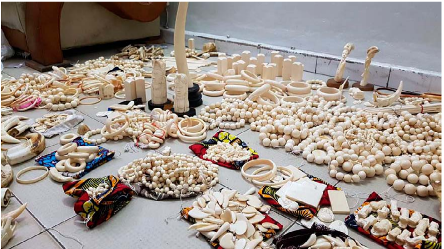
2 international traffickers arrested in Dakar in two back-to-back operations seizing 780 carved ivory items