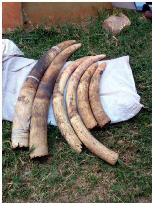
5 traffickers, one of them a pastor, arrested in western Uganda with 10 tusks

■ 5 traffickers, one of them a pastor, arrested in western Uganda with 10 tusks in two back-to-back operations. First two traffickers were arrested with 6 tusks when their car was intercepted at a road check. The third one was arrested while waiting for them in a lodge to get his share of the money.