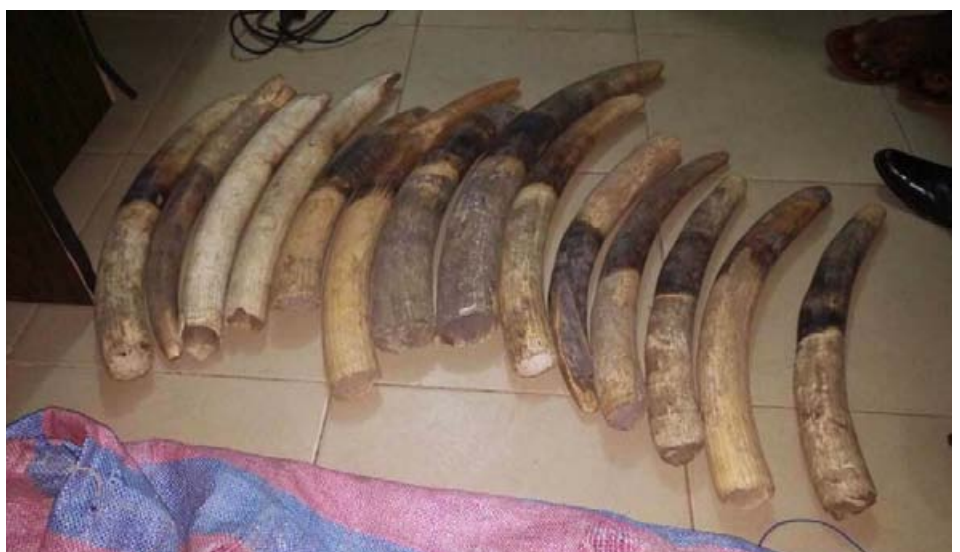
2 ivory traffickers arrested with 14 tusks.