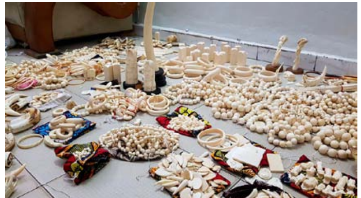
2 international traffickers were arrested in Senegal and 780 carved ivory items were seized

4 ivory traffickers arrested in 2 different operations in Gabon. 3 ivory traffickers were arrested in the capital city. The first two are brothers and were arrested in the act, trying to sell 2 elephant tusks. They admitted to taking ivory from their uncle who works with them. He was arrested two days later. An ivory trafficker, a repeat offender, arrested with 2 large fresh elephant tusks in Franceville. He was previously arrested for ivory trafficking in 2014, while carrying 4 tusks on a train to the capital city, and he spent 6 months in prison. This case points to the necessity of stronger