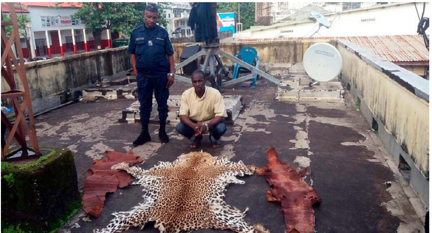
A trafficker arrested with a leopard skin and two crocodile skins in Conakry