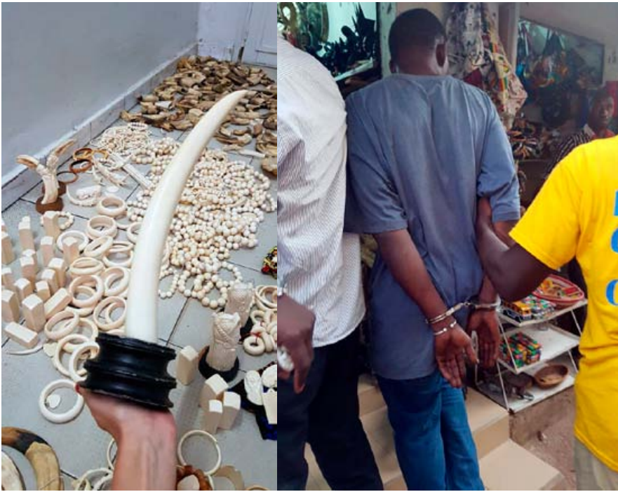
2 international traffickers arrested in Dakar in two back-to-back operations seizing 780 carved ivory items

cess of managing the contraband seized during the arrests in Senegal.